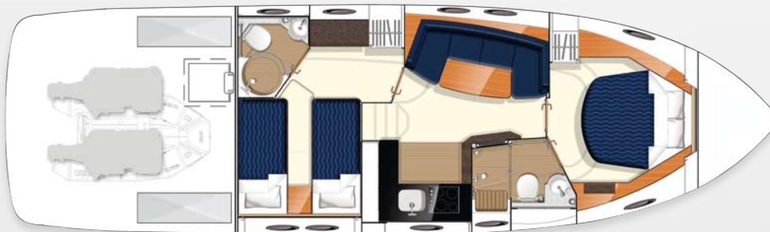
Lower accommodation layout