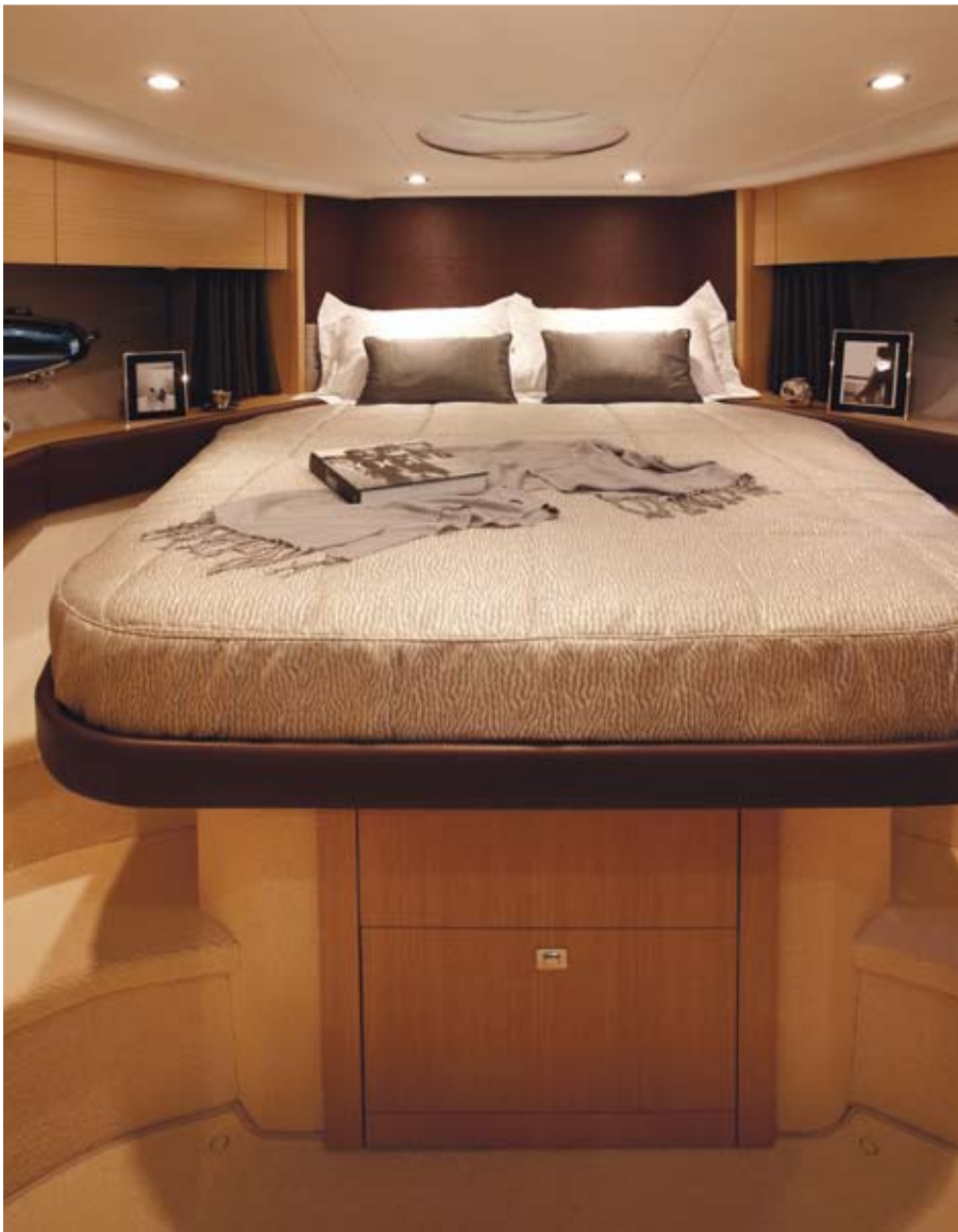
Helm • Owner's Suite • Saloon