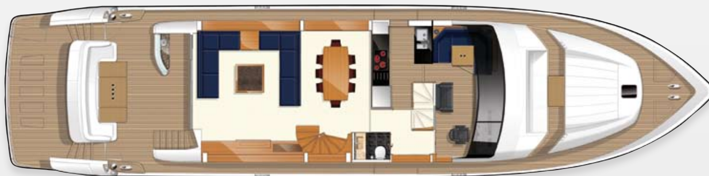
Upper accommodation layout