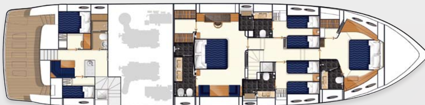
Lower accommodation layout